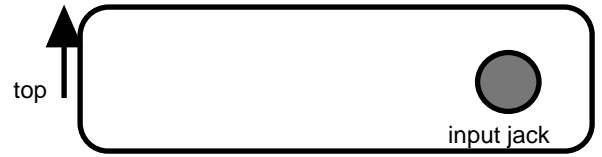
right side view of box